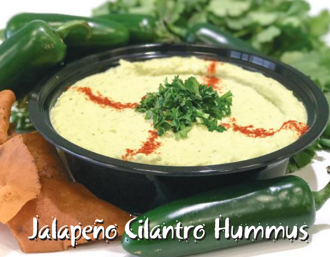
Jalapeño Cilantro Hummus